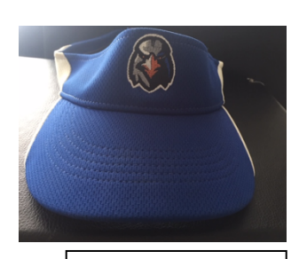
VISOR or HAT -$17 - not required but recommended